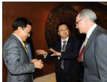
(Left to right) Li Hejun, Chairman & CEO, Hanergy Holding Group; Liang Xinjun, Vice Chairman & CEO, Fosun Group; Timothy Forbes